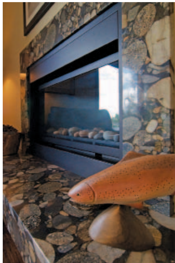
Jurassic granite surrounds the fireplace.