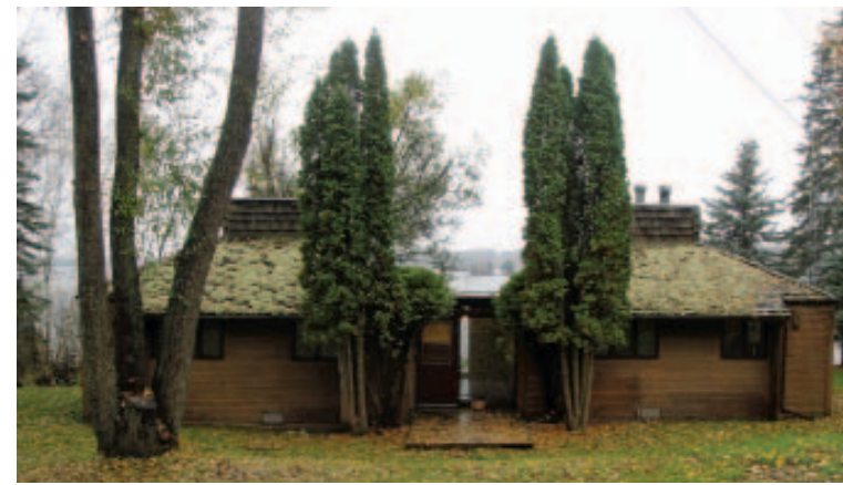
The pre-construction back of the cottage (above) and the lakeview side of the cottage before renovations (right).