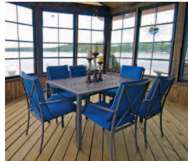
The boathouse has big views and a kitchen.

which they then adjusted to meet their own design tastes and lifestyle needs.