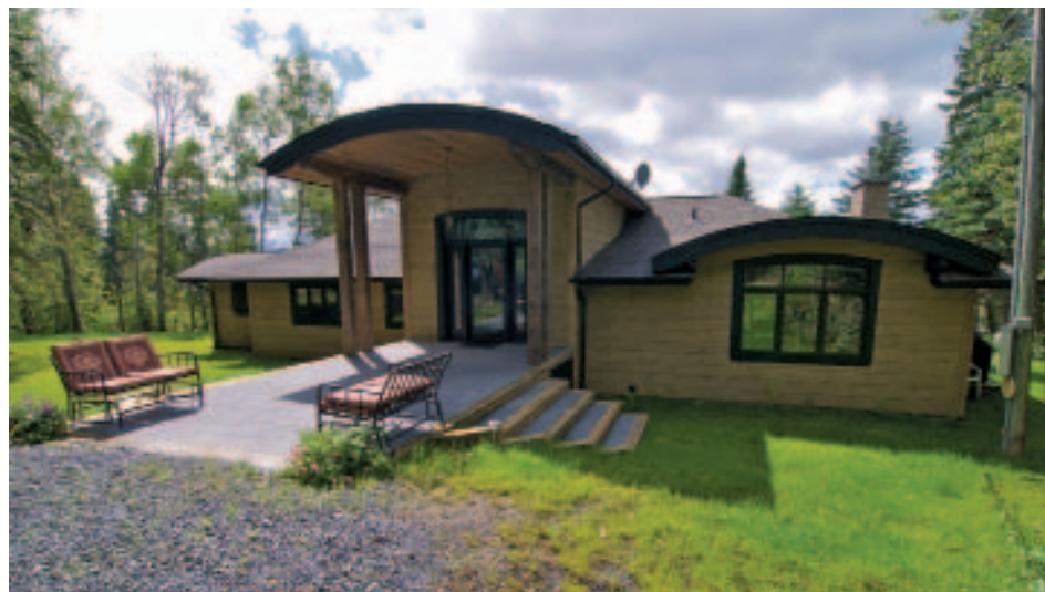
The back of the cottage got a makeover that features distinctive rounded rooflines.